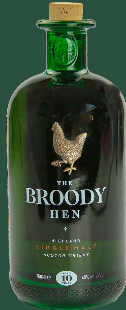
The Broody Hen 10 Year-Old Single Malt

Every bottle of The Broody Hen Scotch Whisky is matured in specially selected casks, before being hand labelled and bottled in our distillery.