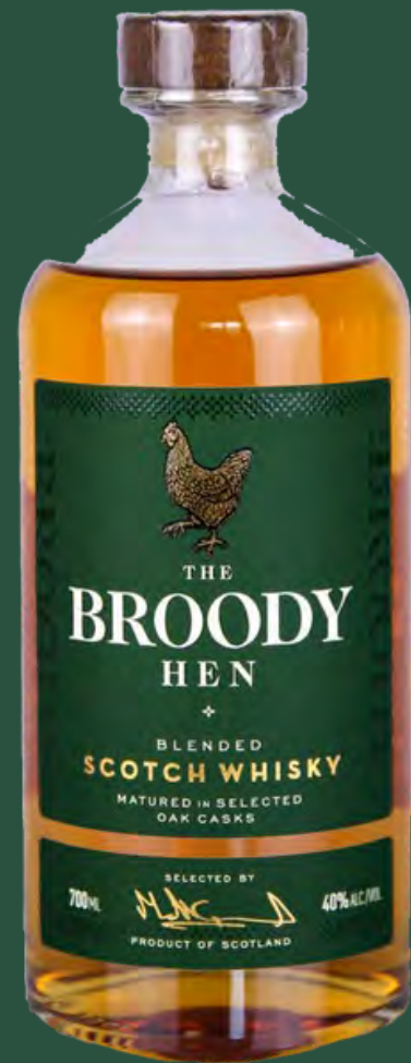
The Broody Hen Blended Scotch Whisky